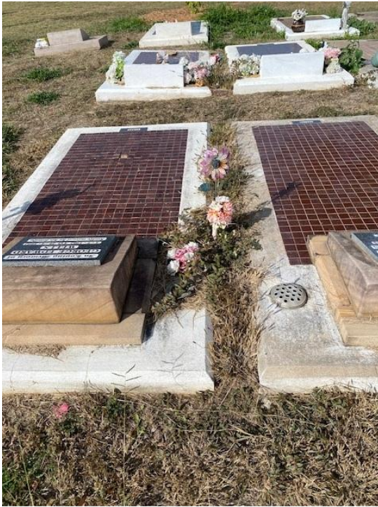
Photo showing an example of a permanent strip of concrete between graves

Photo showing an example of the growth between the graves